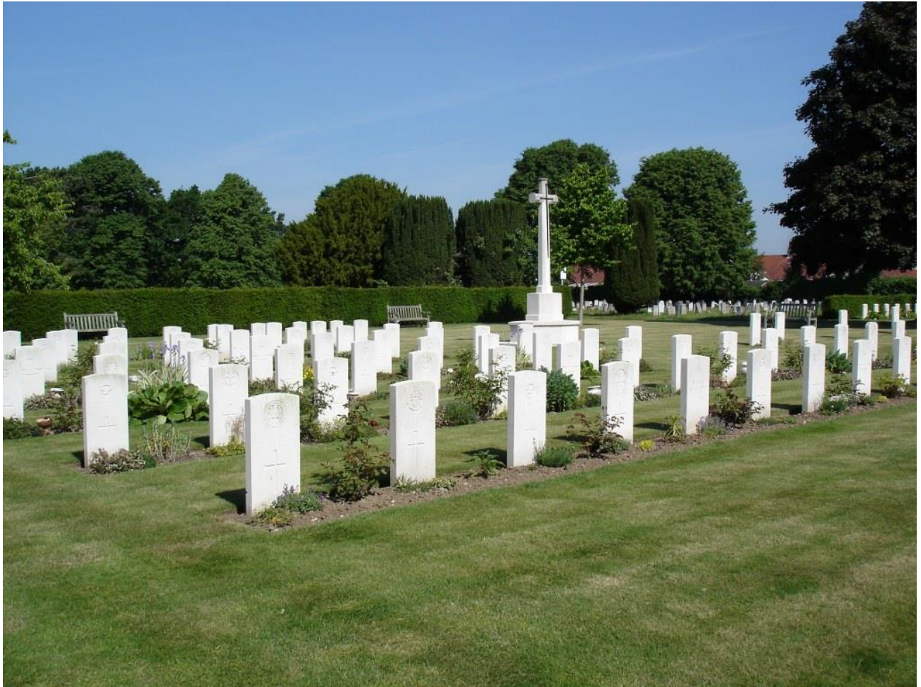
Ann's Hill Cemetery, Gosport, Hampshire